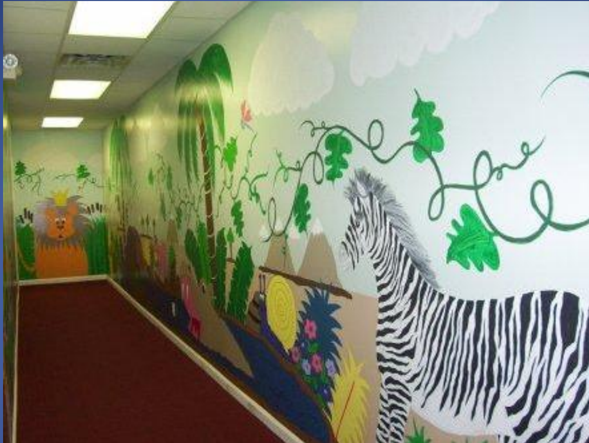
The Junior League of Fayetteville painted murals of friendly jungle animals on the walls of the hallways that lead to interview and waiting rooms.